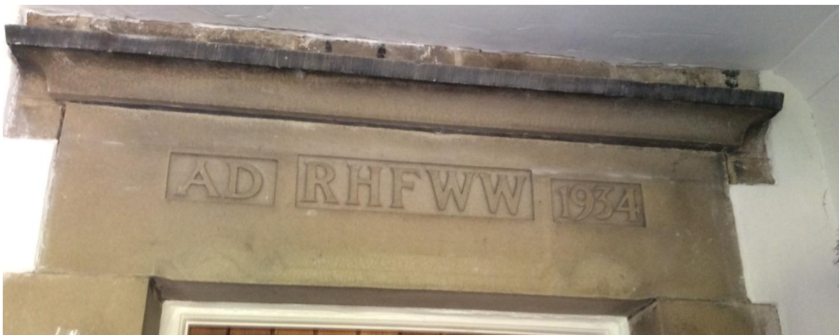
A dated lintel above what was originally the front door of Moorend

He was also responsible for building Moorend, the house at the very top of Starkey Lane.